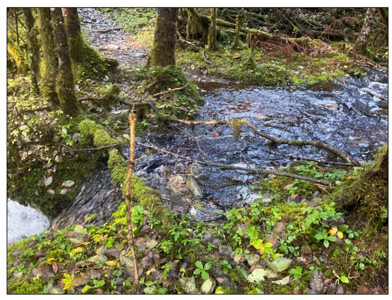
Figure 1.—Small falls at confluence of tributary 1 and main channel downstream of waypoint 1020.