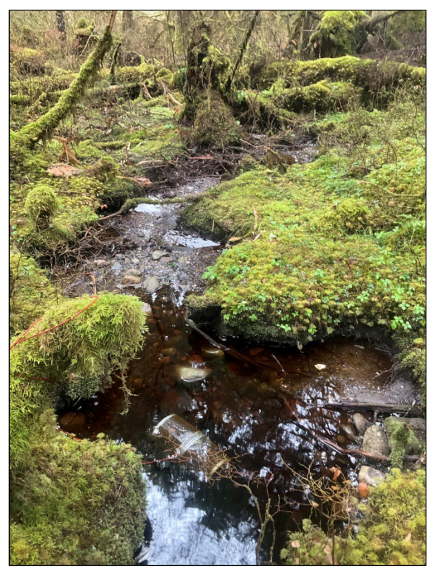
Figure 3.–Downstream view of re-channelized stream at waypoint 1098.