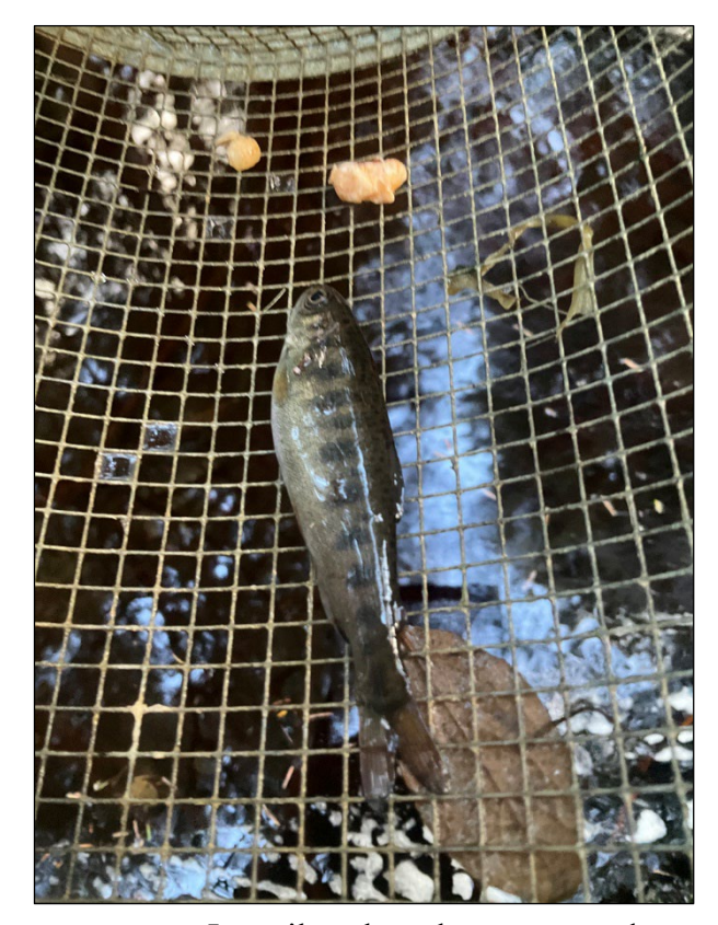
Figure 2.–Juvenile coho salmon captured at waypoint 1020.